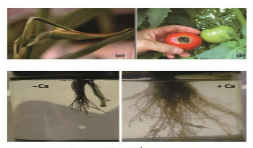
Figure 4. Calcium deficiency symptom Figure: 4