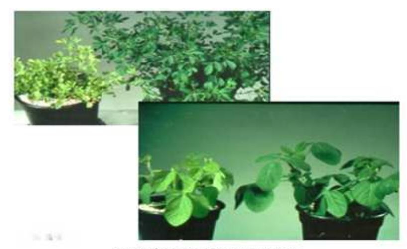
Figure3.Sulfur Deficiency symptom